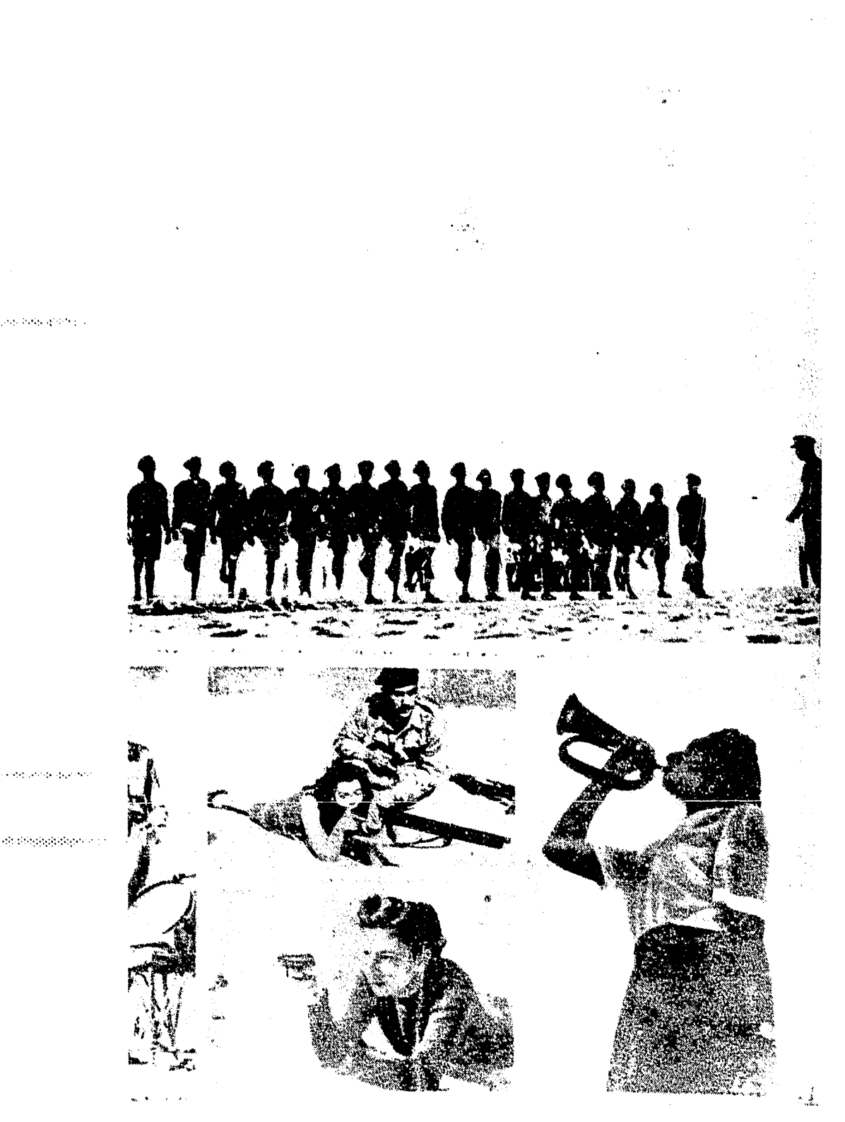
Al-Musawwar, Cairo, January 10, 1948.