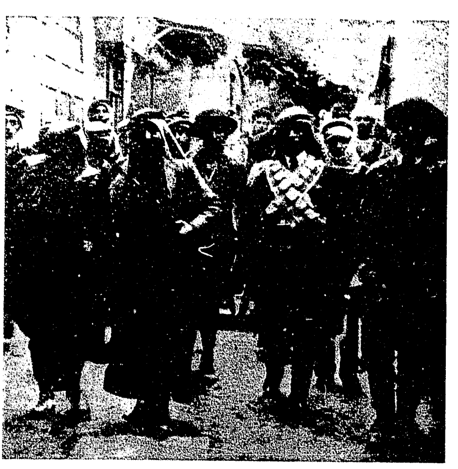
PLATE 15 PROCESSION OF ARAB WARRIORS THROUGH JERUSALEM