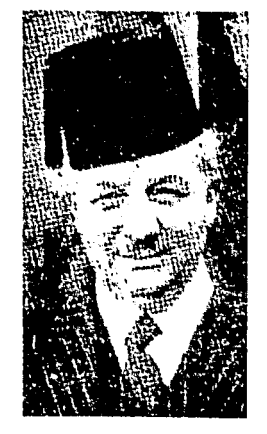
رياض الصلح بك

ا الدربية ككيان عام متعسسل • ولحن فى لينان نشعر شعورا كاملا بخطورة هذا الامر وخطره لذلك ترى اللبنانييزمجيعا في جد وسعى > لايغترون ولا بتوانون> ولا يبخلون ولايقتصدون فى تنذية ساحة الجهاد العربى بغلسطين بالمال والمتاد والرجال •