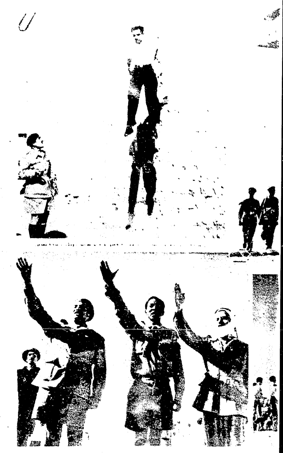
Preparations for the invasion of Palestine. At the Helwan Barracks in Egypt.