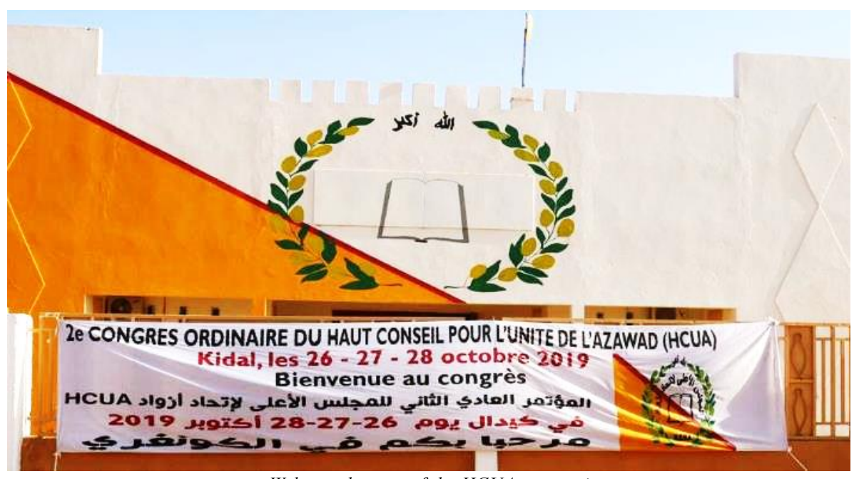
Welcome banner of the HCUA convention

3. The season opened with the second HCUA regular convention in Kidal, from 26 to 28 October 2019 – the first one having taken place in May 2014. Alghabass Ag Intalla was reappointed as secretary general of the HCUA in front of around 500 participants. The military parade included an approximate number of 90 vehicles and 600 fighters.