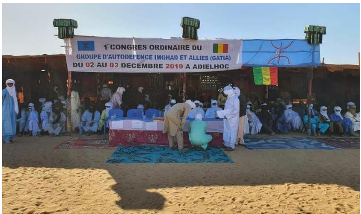
Photograph of the venue of the GATIA convention in Aguelhoc (Adjelhoc)