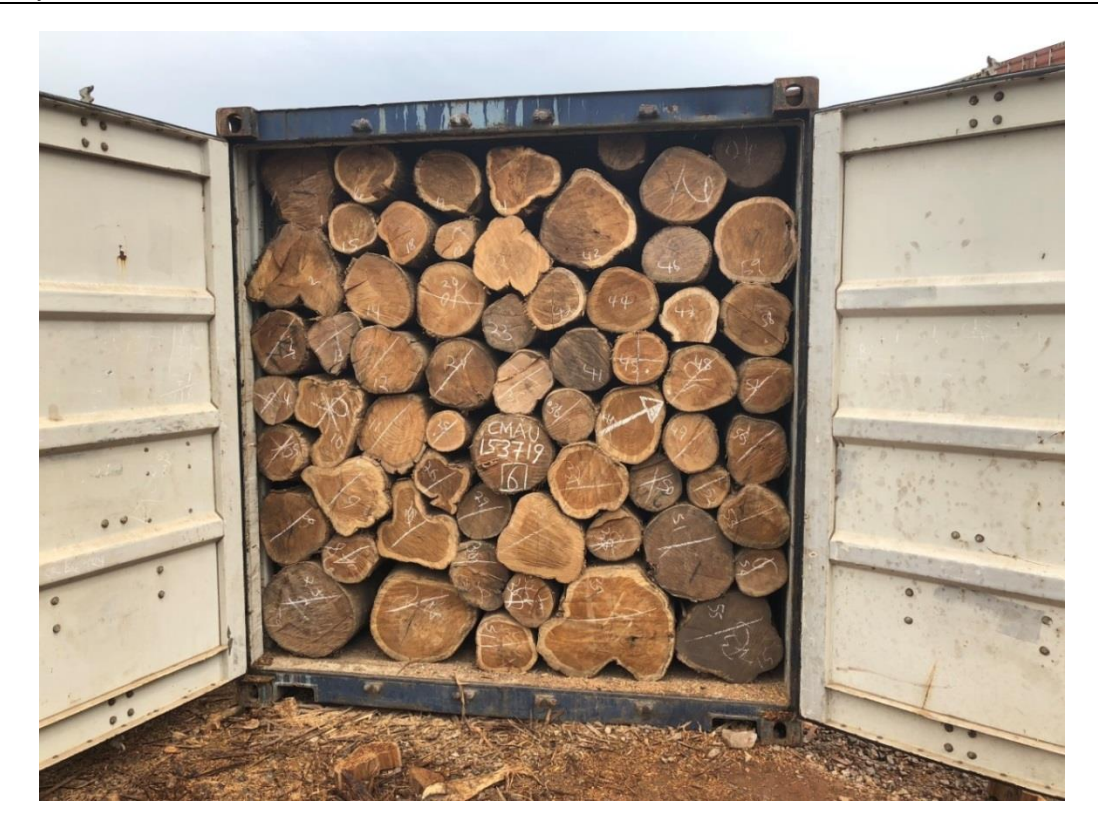
Figure I Uncut teak logs loaded in a shipping container at a warehousing facility outside Kampala, Uganda.

During the course of its investigations, the Panel visited an international trading firm outside Kampala, Uganda and spoke with teak buyers there. Teak traders pay USD $7,000 to $8,000 per truckload of uncut teak from South Sudan, which for 80 to 100 trucks per month amounts to anywhere from $560,000-$800,000 paid to traders and middlemen. The logs are either loaded directly (Figure II) or milled with chainsaws and then loaded into containers. The containers are then loaded on to trucks and travel via road to Mombasa, Kenya for export—most frequently to buyers in from Middle East and Asia. Buyers in these countries pay anywhere from $500 to $1,000 per cubic meter of teak, depending on the size and quality of the trees or planks, putting the market value of the teak coming out of Loka each month at $3-6 million. Teak traders whom the Panel interviewed confirmed that the logs shown in Figures I and II are from Loka Plantation, and that traders expect the teak in the 20 foot container shown in Figure I to sell for $650-$700 per cubic meter, or $21,580 to $23,240. Since the Central Equatoria State government pushed CETC off the concession, one industry expert estimates that 140,000 cubic meters of teak has been harvested, representing a market value of approximately $91 million and lost government revenue of approximately $14 million.