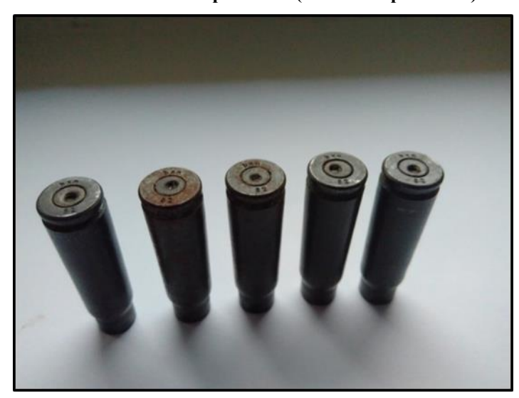
Figure I 7.62x39mm shell casings with markings consistent with manufacture in the former Czechoslovakia, collected at the UNMISS Bor protection of civilians site after the attack of 17 April 2014 (head stamp BxN 82)

76. Shell casings collected as evidence from the massacre indicate that the attackers likely had access to ammunition previously documented as being held in South Sudan Government stocks (see figure I). 124 However, the 7.62x39mm rounds (used in AK-pattern assault rifles) marked 211_79 (pictured in figure II) had not previously been documented in South Sudan by arms experts. 125 This may mean that the ammunition was brought into the country and issued to the attackers shortly before April 2014 and is therefore a potentially productive line of inquiry. Unfortunately, the Panel has not been able to advance this line of inquiry despite efforts to do so.