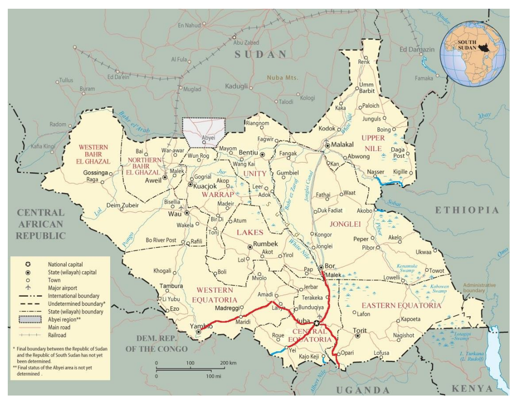
Figure III South Sudan Road map with SPLA (red) and SPLA-IO (blue) checkpoints on which Panel has data on transit taxation.