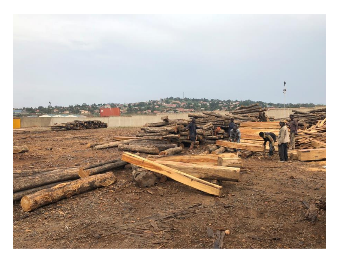
Figure II Workers at a warehousing facility outside of Kampala cutting up uncut teak logs from South Sudan.