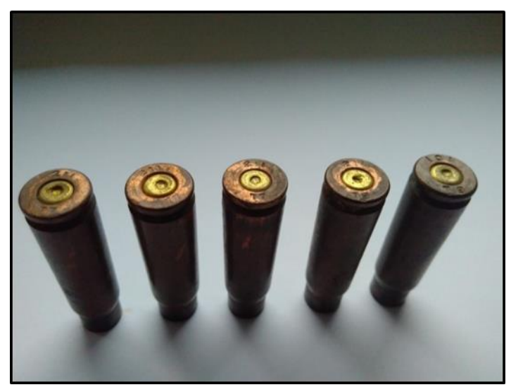
Figure II 7.62x39mm shell casings with markings consistent with manufacture in China, collected at the UNMISS Bor protection of civilians site after the attack of 17 April 2014 (head stamps 211_77, 211_79 and 101_79)

77. On 2 January 2018, the Panel coordinator and arms expert wrote to the Permanent Mission of China to the United Nations requesting assistance in identifying the manufacturer of these rounds "in the hope that [the Panel]can more accurately trace their distribution [and] identify the perpetrators of the massacre". 126 This is not the first time the Panel has recorded Chinese weapons and ammunition in South Sudan or sought assistance in tracing their origin. 127 In an email response to the coordinator dated 29 January 2018, the Permanent Mission of China stated that China had always strictly implemented relevant Security Council resolutions, adopted a cautious and responsible attitude when it comes to arms export, and never exported arms to non-State entities or individuals. The Mission further stated that it had reason to doubt that the Panel had the mandate to raise events which had taken place in April 2014, almost one year prior to the adoption of resolution 2206 (2015), by which the Council established the sanctions regime. Furthermore, "we seriously urge the Panel … to carry out its activities in accordance with the mandate of the resolutions and in an objective and just manner".