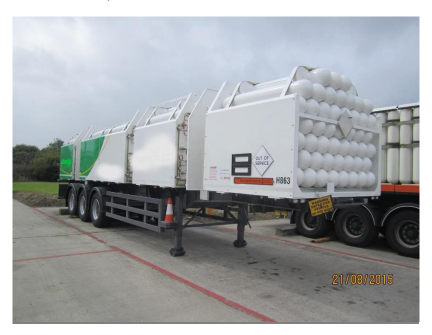
Battery vehicle constructed with seamless steel cylinders