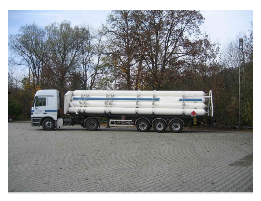
Battery vehicle constructed with seamless steel tubes