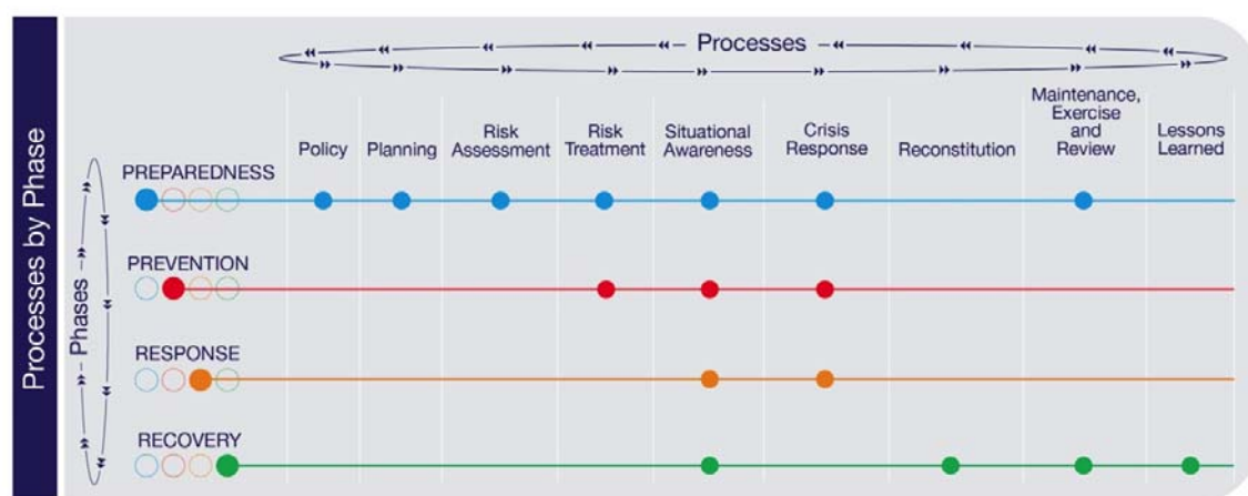
Figure 1 Organizational resilience management system

10. Based on the iterative process of continuous learning and improvement, and empowering personnel to tailor the implementation to meet local conditions, the principles of the organizational resilience management system are as follows: