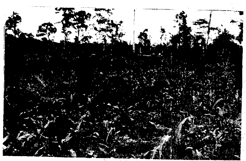
12. Agricultural production