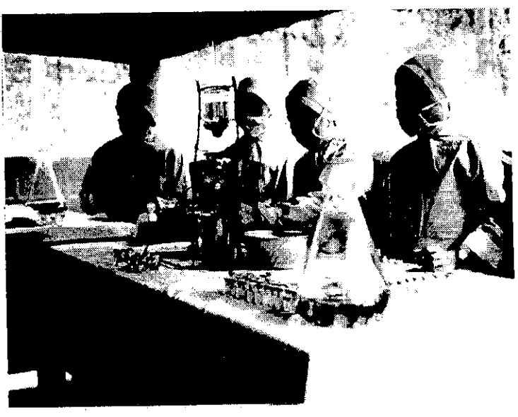
9. Medical personnel