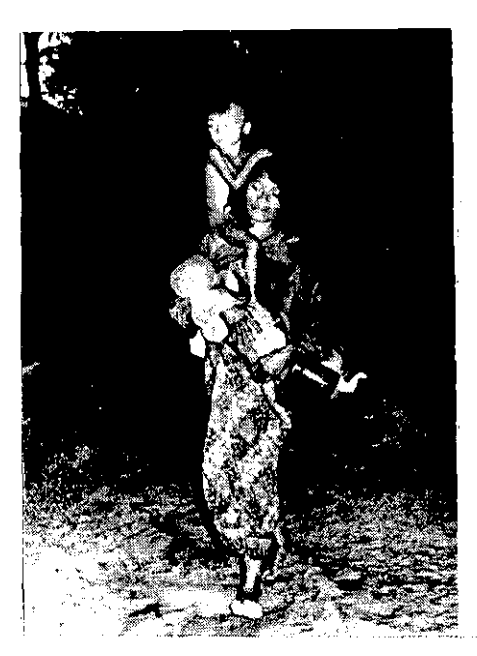
5-6. Women and children fleeing from the Vietnamese attack on the Phnom Chhat refugee camp, in western Kampuchea (March-April 1983)