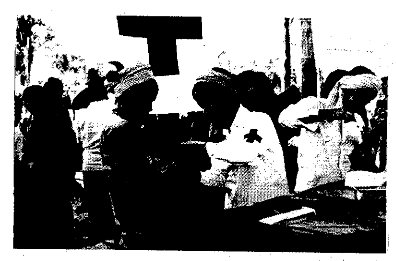
10. Vaccination of babies