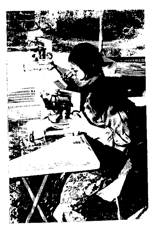
8. A laboratory technician