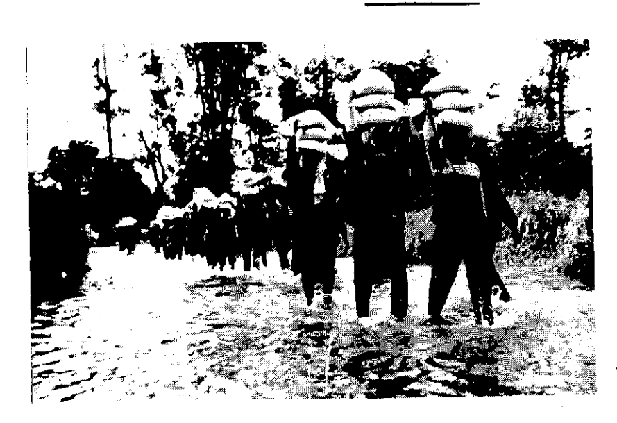
7. Transporting food