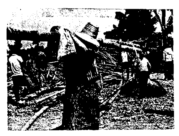
Khmer refugees in Thailand moving to a new camp.

(Photographs published in Bulletin No. 96 of the International Committee of the Red Cross, dated 11 January 1984)