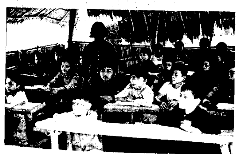
11. Primary school