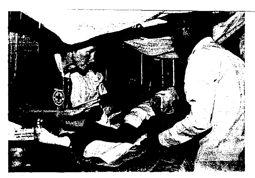
A seriously burnt child is cared for at the Khao-I-Dang hospital.